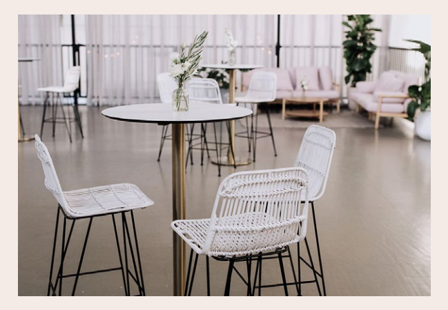
COCKTAIL The ideal space for your guests to meet, greet and toast.

A beautiful, light-filled restored warehouse space with two options for seating.