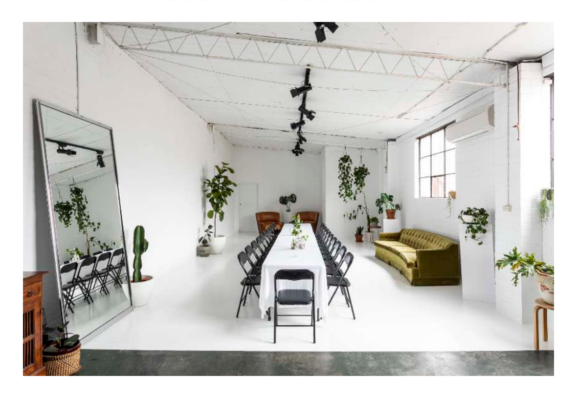
Sit-Down Furniture Hire Package