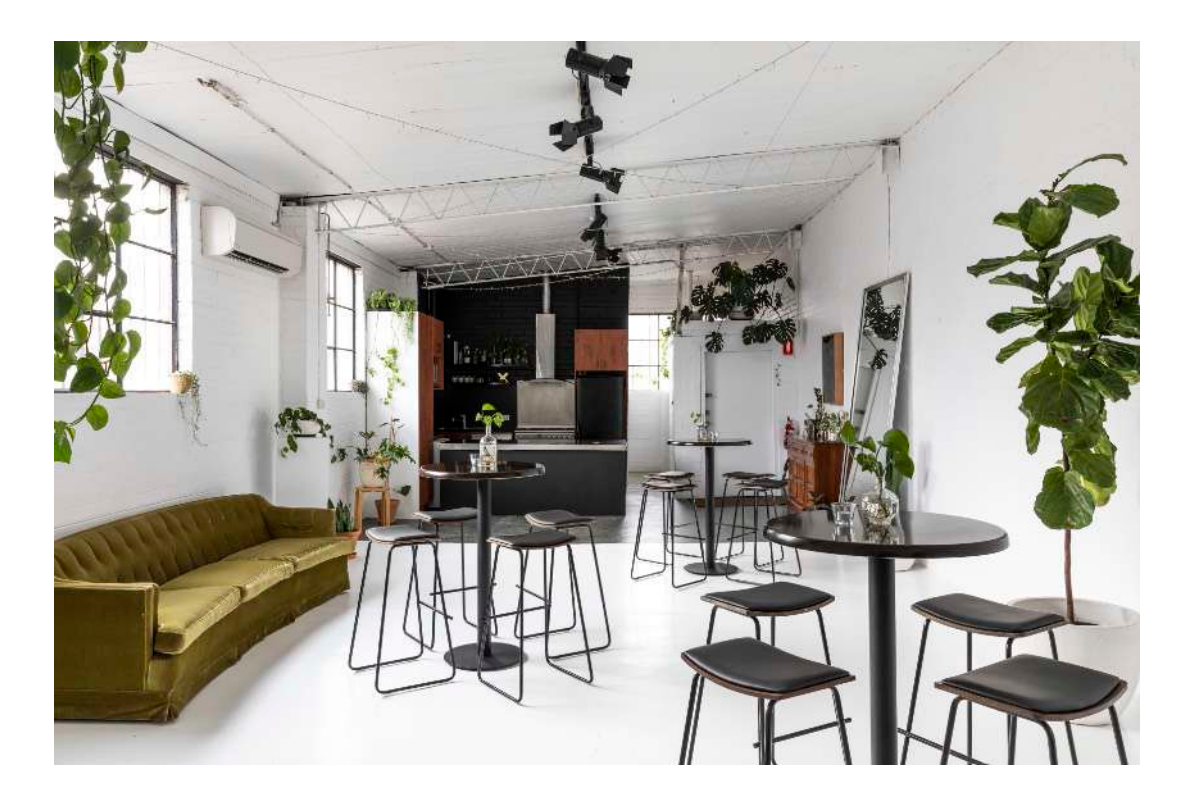
Cocktail Furniture Hire Package