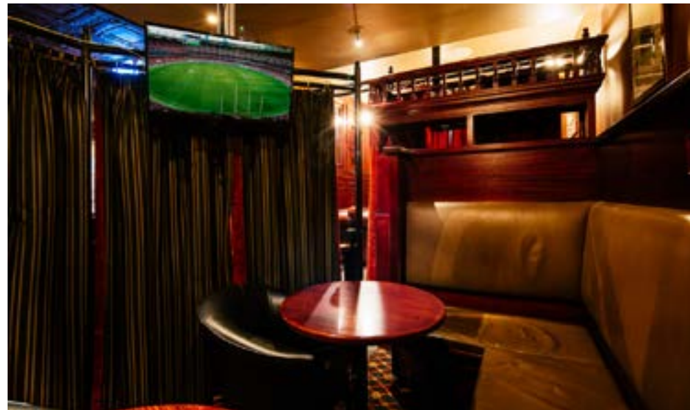
WHITE ROOM UP TO 8 SEATED