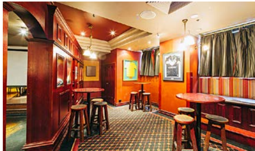
BOOKIES ROOM 20 SEATED / 30 STANDING