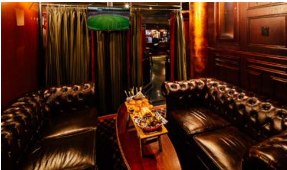
CHESTER ROOM UP TO 6 SEATED