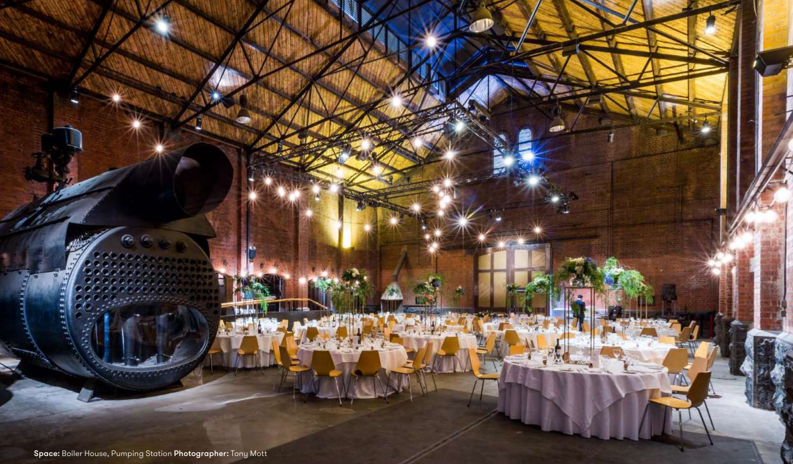
Space: Boiler House, Pumping Station