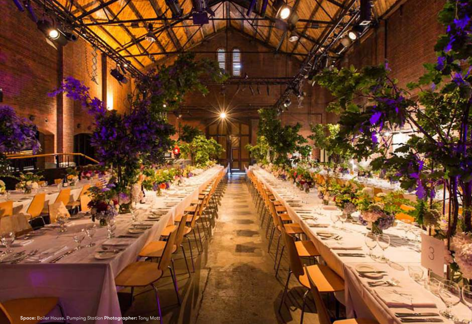
Space: Boiler House, Pumping Station

An award-winning museum, Scienceworks is an experience as much as a destination. And we love hosting events in its galleries, courtyards and historic buildings.