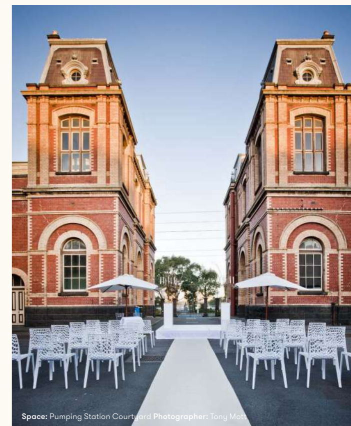
Space: Pumping Station Courtyard

An award-winning museum, Scienceworks is an experience as much as a destination. And we love hosting events in its galleries, courtyards and historic buildings.