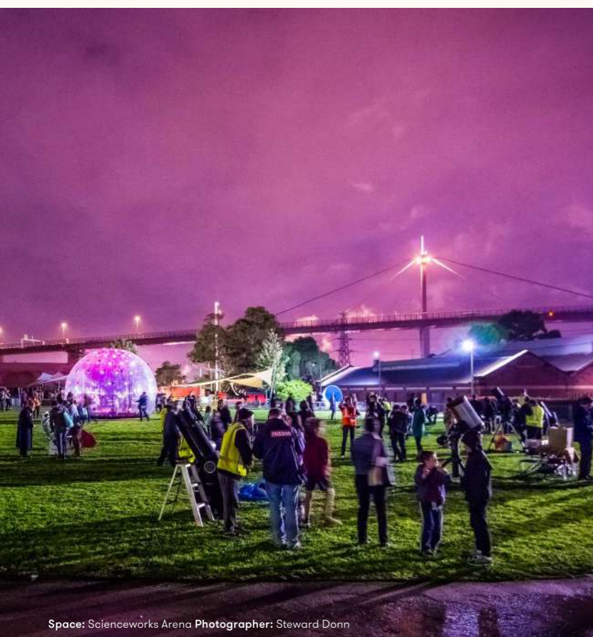
Space: Scienceworks Arena

From soaring industrial spaces to open lawns and interactive exhibits, it's an inspiring starting point—whether you're thinking fun, formal, intimate or large-scale. Weddings, product launches, cocktail parties, corporate dinners and family days are more than possible, and we're happy to help you customise each space.