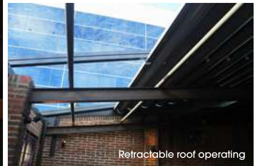
Retractable roof operating