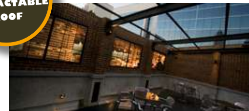
Rooftop Terrace Bar 360° view: http://www.function360.com.au/universal-bar/2/2.php

Please note that Rooftop Terrace Bar Bookings are not confirmed until receipt of $400 deposit. Any cancellations or date changes must occur before 8 weeks from booked date otherwise deposit is non-refundable.