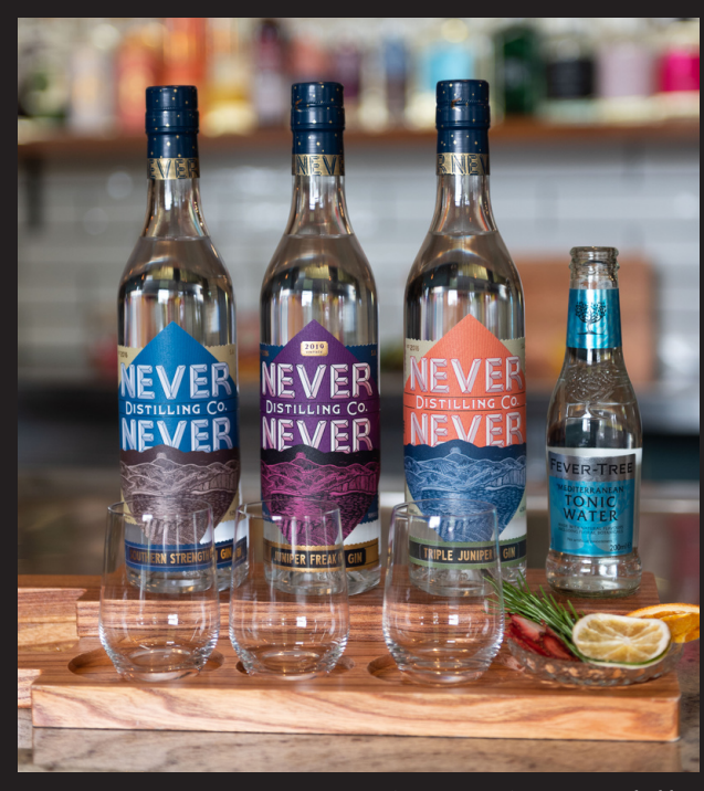
Gin Tasting Paddle

WIFI FREE CAR PARKING ON SITE LINEN PRIVATE BAR PRIVATE BATHROOMS EXTRA SET-UP TIME