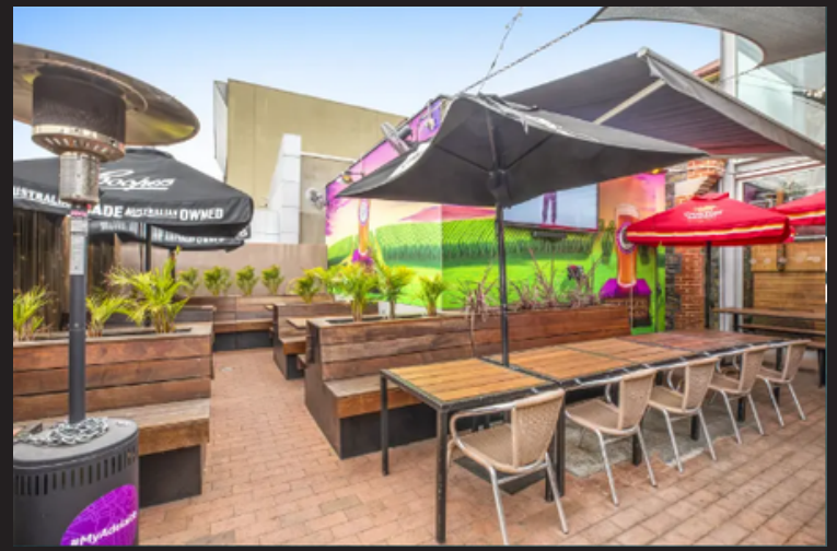
The L-shaped Beer Garden

Whether for a reunion, pub crawl, bucks show, hens night or place to watch all the big games, The Archer's Beer Garden can accommodate.