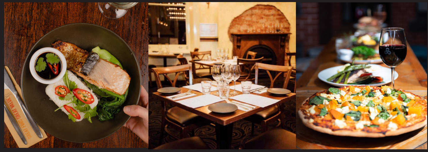
Teriyaki Salmon Fillet

The room has direct & private access to the back bar whilst being predominantly secluded from the noise of the front facade. Perfectly suited to business lunch meetings, conferences, mixers, dinner parties and smaller birthdays.