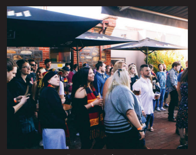
Beer Garden, Game Day

Off: Feb 1 - Oct 30 // On: Oct 31 - Jan 31