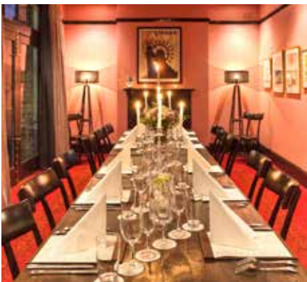
Grand Dining Room

The Glenmore Lounge located on the middle level hosts a collection of intimate function spaces perfect for private dining or gatherings. With its own cocktail bar and lounge area, this level is ideal for those who would like their own private room with personal attention and service.